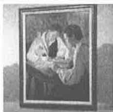
What is hung at the visitors center

But little did I know of my errors. Even teaching the Urim and Thummim was incorrect. Sure he used those for the first 116 pages that were later lost and never published, but what the Book of Mormon is today was dictated while Joseph put his head in a hat and looked at a stone. While he used this technique the plates were sometimes not even in the same room or house. Why were the plates then needed? I mean look at Nephi who killed for a set of plates for crying out loud!