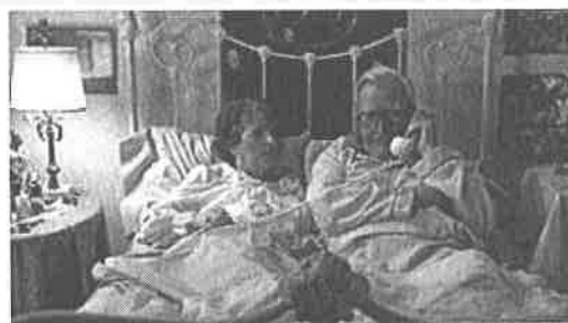
Not Elder Perry

The second time I came across Elder L. Tom Perry I was flipping through the channels late one night and settled for Sixteen Candles while I brushed my teeth and got ready for bed. While brushing and I couldn't believe my eyes! There he was in the movie! I never knew he was an actor. But alas when I told my friends about it, they quickly told me that it wasn't him, but an actor named Max Showalter.