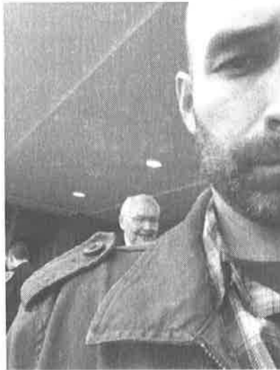
Elder Perry my shoulder angel whispering in my ear "Han Solo shot first"

The second time I came across Elder L. Tom Perry I was flipping through the channels late one night and settled for Sixteen Candles while I brushed my teeth and got ready for bed. While brushing and I couldn't believe my eyes! There he was in the movie! I never knew he was an actor. But alas when I told my friends about it, they quickly told me that it wasn't him, but an actor named Max Showalter.