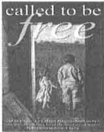
Called to be Free

The biblical requirements for filling this vacancy are stated in Acts, Chapter One: "...men which have companied with us...from the baptism of John, unto...he was taken up from us." Thus, this replacement disciple was to be an eye-witness, with the other 11, of Jesus' ministry and resurrection. The method they used allowed God to choose the replacement. The Apostles prayed and asked the Lord to show them which of the two candidates He had chosen. The lot fell to Matthias, who was ordained and numbered among them (Acts 1:12-26); the new total was still 12.