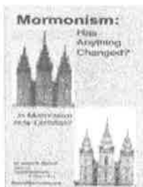
Has Mormonism Changed?