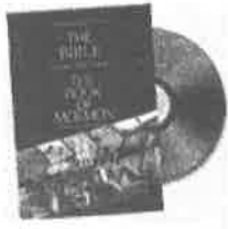
The Bible and the Book of Mormon

ordination as an Apostle was revoked, and that he was no longer considered one of them (John 13:27; 17:12).