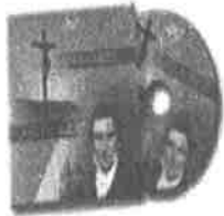
Jesus Christ - Joseph Smith

When he began his public ministry in Israel after his baptism, Jesus personally selected his twelve apostles. After one (Judas Iscariot) betrayed Christ, his office was filled by another (Acts 1:12-26). The resurrected Jesus appeared to two of his disciples on the road to Emmaus and explained what was written in all the scriptures concerning himself (Luke 24:27).