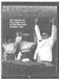
The Temple of the Godmakers