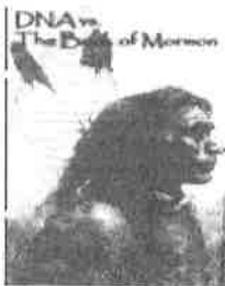
DNA and the Book of Mormon

The Apostle Paul claimed to be an apostle (1 Cor. 1:1) (that's why we call him the Apostle Paul). He was chosen directly by the resurrected Jesus Christ in a vision of blinding light. He was called on the Road to Damascus by Jesus, in a different manner from the Twelve (Acts, Chapter 9). Paul had not been with Jesus during his ministry. This may have been why he did not consider himself to be part of the original 12 Apostles, but claimed to be an apostle abnormally born (1 Cor. 15:8-9).